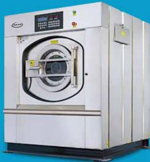
XGQ 23 F