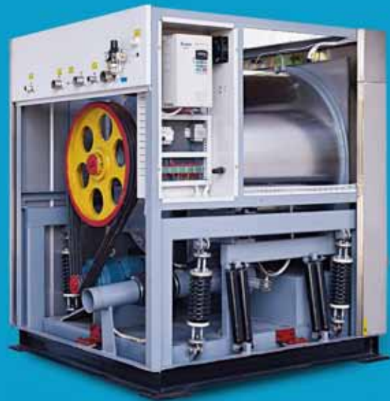
XGQ 150 F