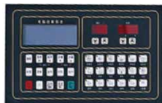
35F - 150F Computer