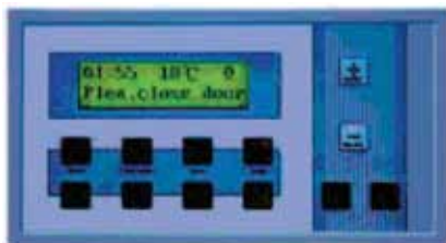
15F - 23 Computer